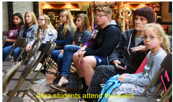
Area students attend the event