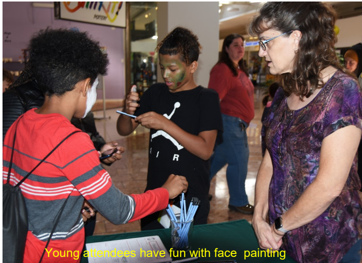
Young attendees have fun with face painting