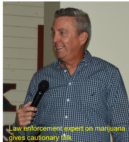
Law enforcement expert on marijuana gives cautionary talk